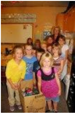
Calvary Chapel food drive

Praise Him, all creatures here below; Praise Him above, ye heav'nly host; Praise Father, Son, and Holy Ghost.